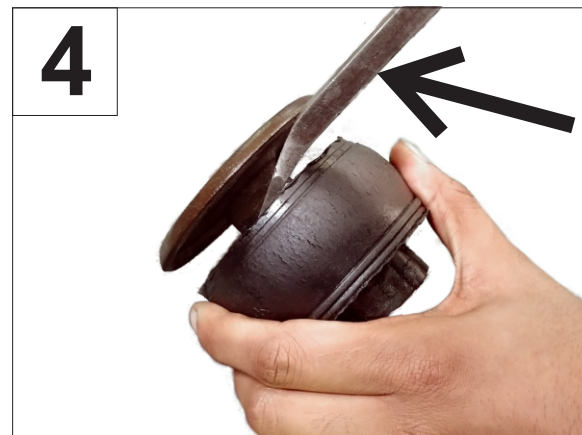
4 Use spray lube and pry-bar to remove old rubber body mount from O.E. metal.