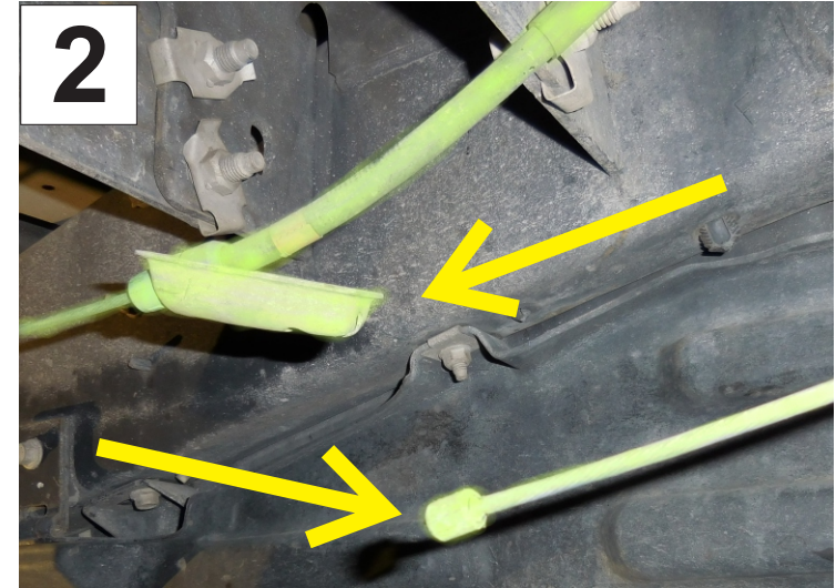
2 Unhook park brake cable located near rear main spring eye on driver's side.