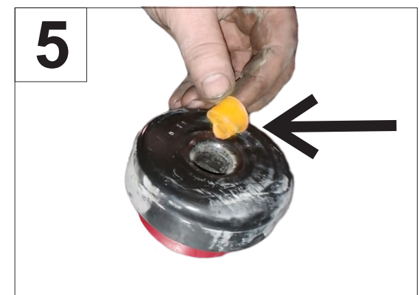
5 Discard orange plastic bolt retainers from top side of all body mounts