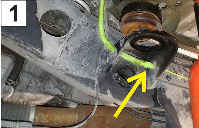
1 Release park brake cable clip from position 2 frame perch on driver's side before lifting body.