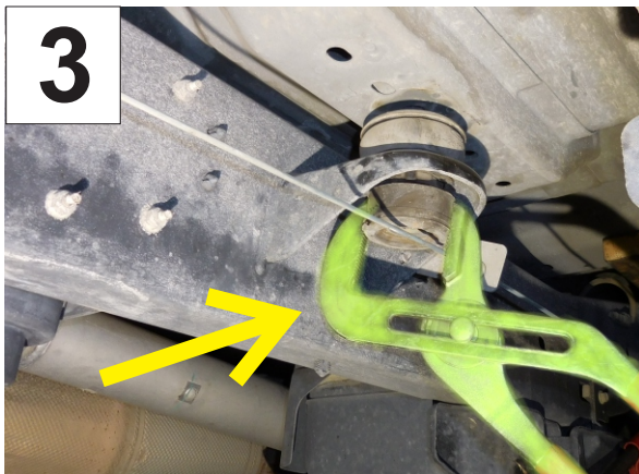
3 Use large chanal tongue and groove plyers to separate bottom half of body mount.