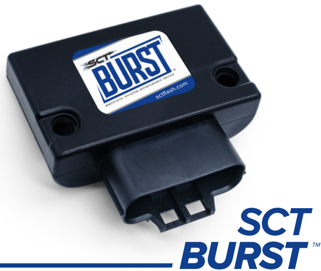
SCT BURST™ Electronic Throttle Enhancement Device