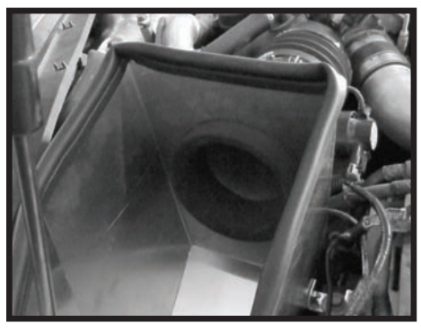
Step 14 Place the velocity adapter in the heat shield making sure the coupler is pushed completely against the heat shield. Once the adapter and coupler are tight against the heat shield, fully tighten the clamp.