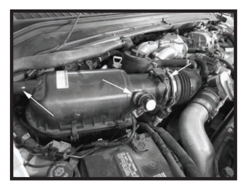
Step 2 Slide the red clip back then disconnect the electrical connector at the Mass Air Flow Sensor (MAFS). Remove filter minder out of air box. Remove auxiliary air line from end of the factory air box.

Safety first! Before you begin the installation, make sure that the vehicle is in park (or neutral for a manual transmission) with the parking brake set. Disconnect the negative battery terminal and verify that all components that are listed are present. Note: This kit was designed and tested on a stock engine without any custom tuning done to the engine computer. Removing the battery cable may erase the programmed radio stations. The anti-theft code will need to be entered into some radios after the battery cable is connected. The anti-theft code can typically be found in the owner's manual or at your local dealership.