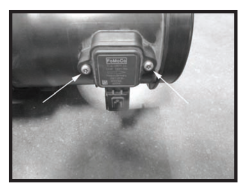
Step 4 Remove the MAFS from the factory intake tube.