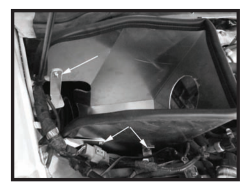
Step 10 Install the heat shield using the supplied hardware and fasten securely once in place.