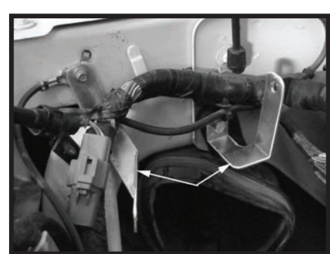
Step 7 Install two brackets as shown, the bracket on the left uses factory hardware and the bracket on the right uses supplied hardware.