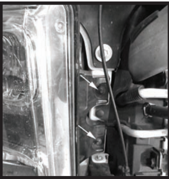
Step 18 Remove hardware from the headlight mount.