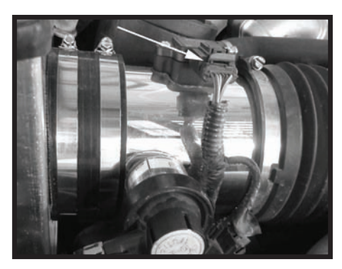
Step 13 Reconnect the mafs and the filter minder.