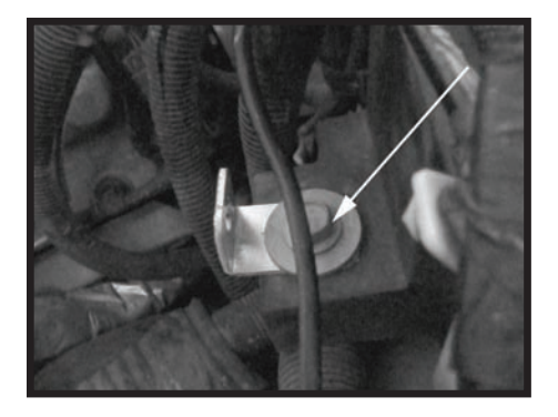
Step 8 Install battery side bracket using hardware that was emoved in step 6.