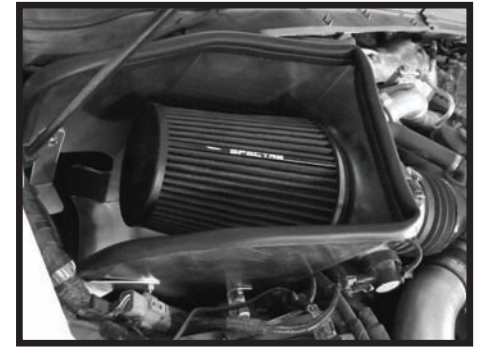
Step 15 Install the filter and fully tighten the clamp.