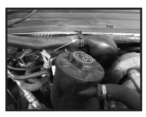
Step 5 Remove the clip then remove entire auxiliary air line from vehicle.