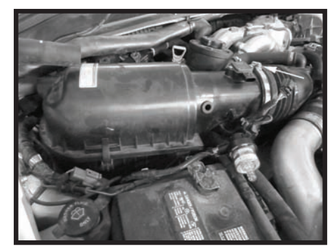
Step 3 Loosen the clamp on the factory air box. Remove the factory air box from the vehicle by lifting upwards. There are factory grommets on the bottom side so pull firmly.