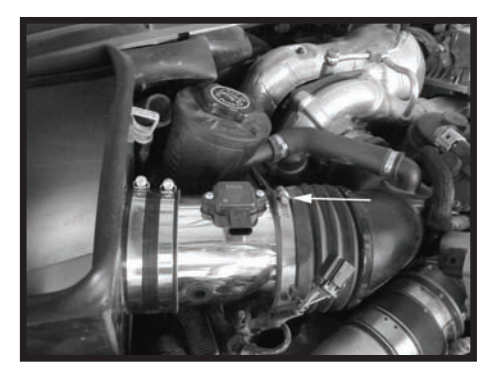
Step 12 Install the intake tube into the vehicle, position it as shown and once tube is in desired location fasten securely.