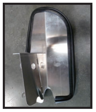
Step 17 Install bulb seal around edges of air scoop as shown.