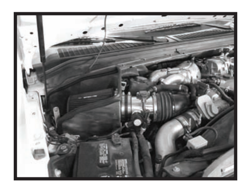
Step 20 Reconnect the battery cable, start the vehicle and let it warm up. Shut off and inspect the installation once more for any loose clamps, wires, or hardware. Test drive & enjoy! Your installation is now complete. Periodically check all clamps and brackets.