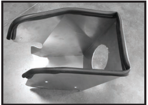
Step 9 Install bulb seal around edges of heat shield as shown.