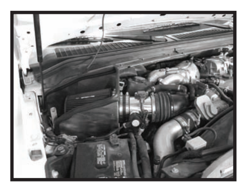
Step 16 Make sure that all clamps and hardware are fully tightened.