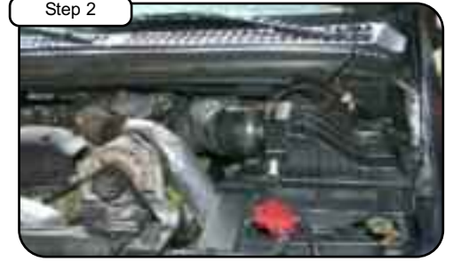
Complete Stock Intake. Disconnect battery before install.