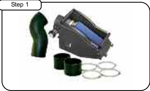
Complete kit components

advanced FLOW engineering™ P.O. Box 1719 Corona, CA 92878 Support: 951-493-7100 aFepower.com