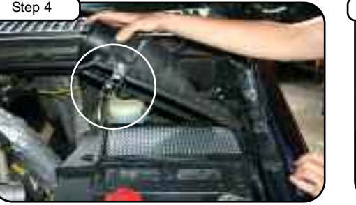
Loosen the air box lid clamps and remove air box lid and OEM air filter.