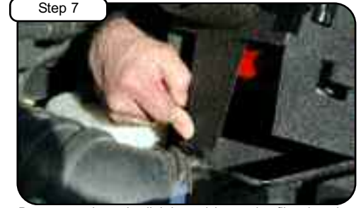
Depress spring tab slightly and lower the filter housing down into OE housing until the spring tab snaps into place.