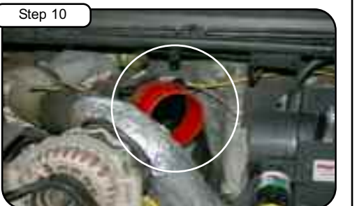
Place the coupler and clamps over the turbo inlet. Do not tighten the clamps at this time.