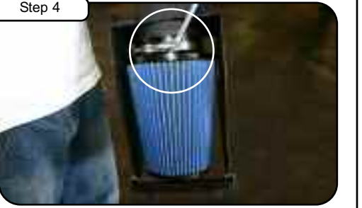
Place the new air filter inside the new housing and tighten the clamp. Next attach the front splash guard to the front of the housing. Secure with the provided screws.