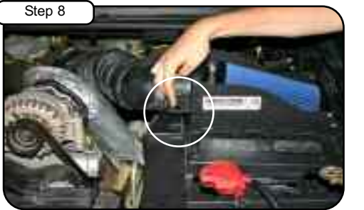
Insert the 1.5" hose into the nipple on the side of the housing. The filter minder will be placed here.