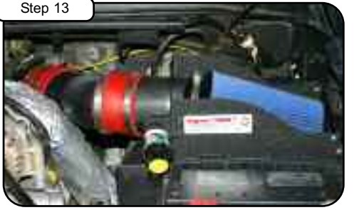
Your aFe intake installation is now complete. Make sure all clamps are tight and that all electrical components are secure. Check and tighten connections after a few hours of operation. Thank you for choosing aFepower!