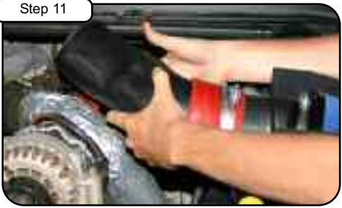
Slide coupler and clamps on tube. Position assembly into the intake kit.