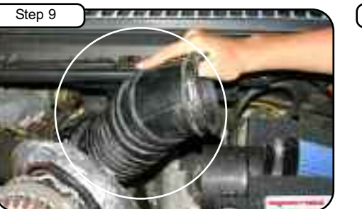
Loosen the hose clamps on turbo side. Remove intake duct out of the engine bay.