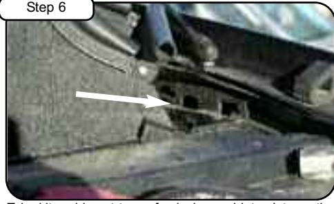
Take kit and insert taps of splash panel into slots on the lower half of OE housing at an angle. (Tabs are to be inserted into and rest on the bottom edge of slots. Do not hook tabs over plastic.