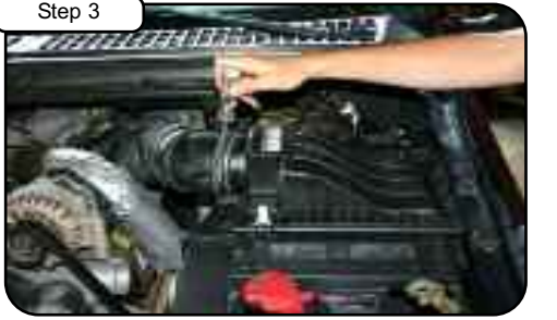
Remove the upper portion of the air box by loosening the hose clamp on the air box. Carefully remove the air filter minder on the side of the air box.