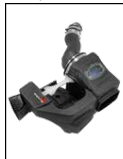
Intake System "Momentum"

P/N: 50-73002 (P10R) 51-73002 (PDS) 75-73002 (PG7)