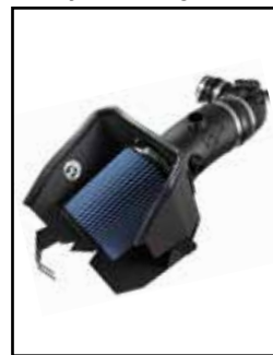
Intake System "Magnum Force"

P/N: 54-41262 (P5R) 51-41262 (PDS) 75-41262 (PG7)