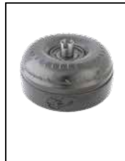
F3 Torque Converter