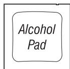
Alcohol Pad x2